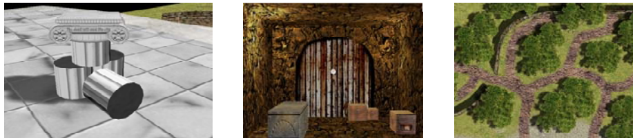
Figure 4. left: 3 rd step, temple ruins, center: 5 th step, catacombs, right: 7 th step, forest map.

image the blind user can feel the 3D grooved map and follow the route to the forest. The 2D image and the 3D map are registered and this allows us to visualize the route that the blind user actually follows on the 2D image. Finally, after finding the forest a new grooved line map is displayed (Figure 4, right) where the blind user has to search for the final location of the treasure.