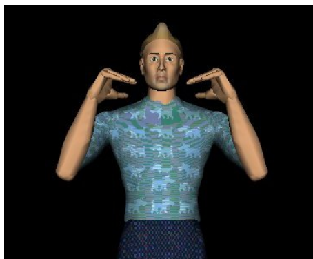
Figure 3. After performing a synthesized sign.

Figure 3 illustrates a snapshot of an avatar performing a sign.