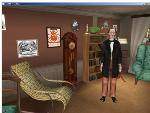
Figure 1. HCA in his study.

The primary use setting for the HCA system is in museums and other public locations. Here, users from many different countries are expected to have conversation with HCA for an average duration of, say, 10-20 minutes. The target users are 10-18 years old children and teenagers.