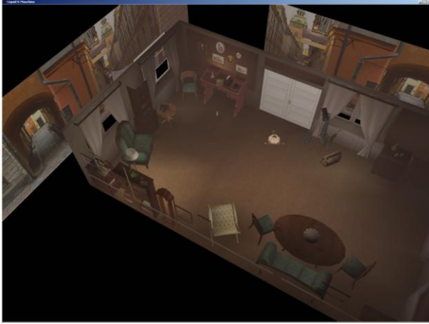
Figure 4. A view from above of HCA's study.