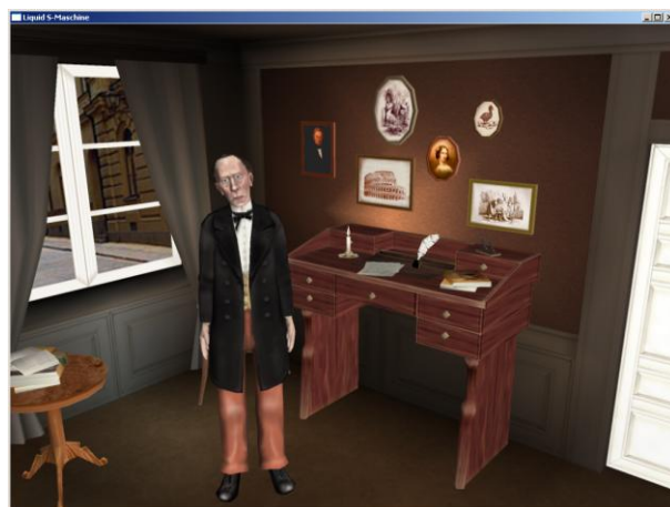
Figure 3. HCA is looking angrily at the user.

The user can control HCA's locomotion by using the keyboard arrow keys and changes virtual camera angle by using the F2 key. A large number of camera angles are available as illustrated in Figures 1 through 4.