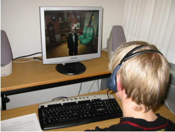
Figure 2. A user in action.

Each user test session took 60-75 minutes. Sessions began with a brief introduction to the system setup and the input modalities available, and calibration of the headset microphone to the user's voice. Then followed 15 minutes of free-style interaction in which it was entirely up to the user to decide what to talk to HCA about. In the following break, the user was asked to study a handout which listed 11 proposals on what the user could try to find out about HCA's knowledge domains, make him do, or explain to him. Some examples are that the user could make HCA tell about his life and family relations, tell HCA about games the user likes, collect as much information as possible about the place where HCA lives, or be rude to him and see what happens. It was stressed that the user was not required to try to follow all the proposals. Rather, the user could pick those he or she liked, having a good time in the process. The second session had a duration of 20 minutes. Figure 2 shows a user in action during this session. A total of 26 conversations corresponding to 8 hours of speech were recorded, logged and captured on video.