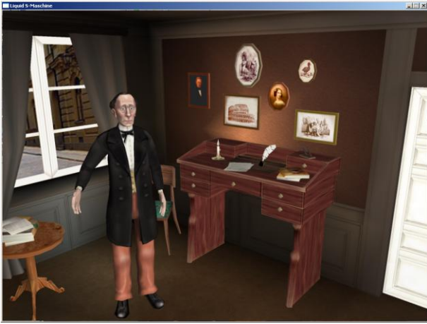
Figure 1. HCA gesturing in his study.

The user sees HCA in his study in Copenhagen (Figure 1) and communicates with him in fully mixed-initiative conversation using spontaneous speech and 2D gesture. Thus, the user can change the topic of conversation, back-channel comments on what HCA is saying, or point to objects in HCA's study at any time, and receive his response when appropriate. 3D animated HCA communicates through audiovisual speech, gesture, facial expression, body movement and action. The high-level theory of conversation underlying HCA's conversational behaviour is derived from analyses of social conversations aimed at making new friends, emphasising common ground, expressive storytelling, rhapsodic topic shifts, balance of "expertise", etc. [2]. When HCA is alone in his study, he goes about his work, thinking, meandering in locomotion, looking out at the streets of Copenhagen, etc. When the user points at an object in his study, he looks at the object and then looks back at the user before telling a story about the object.